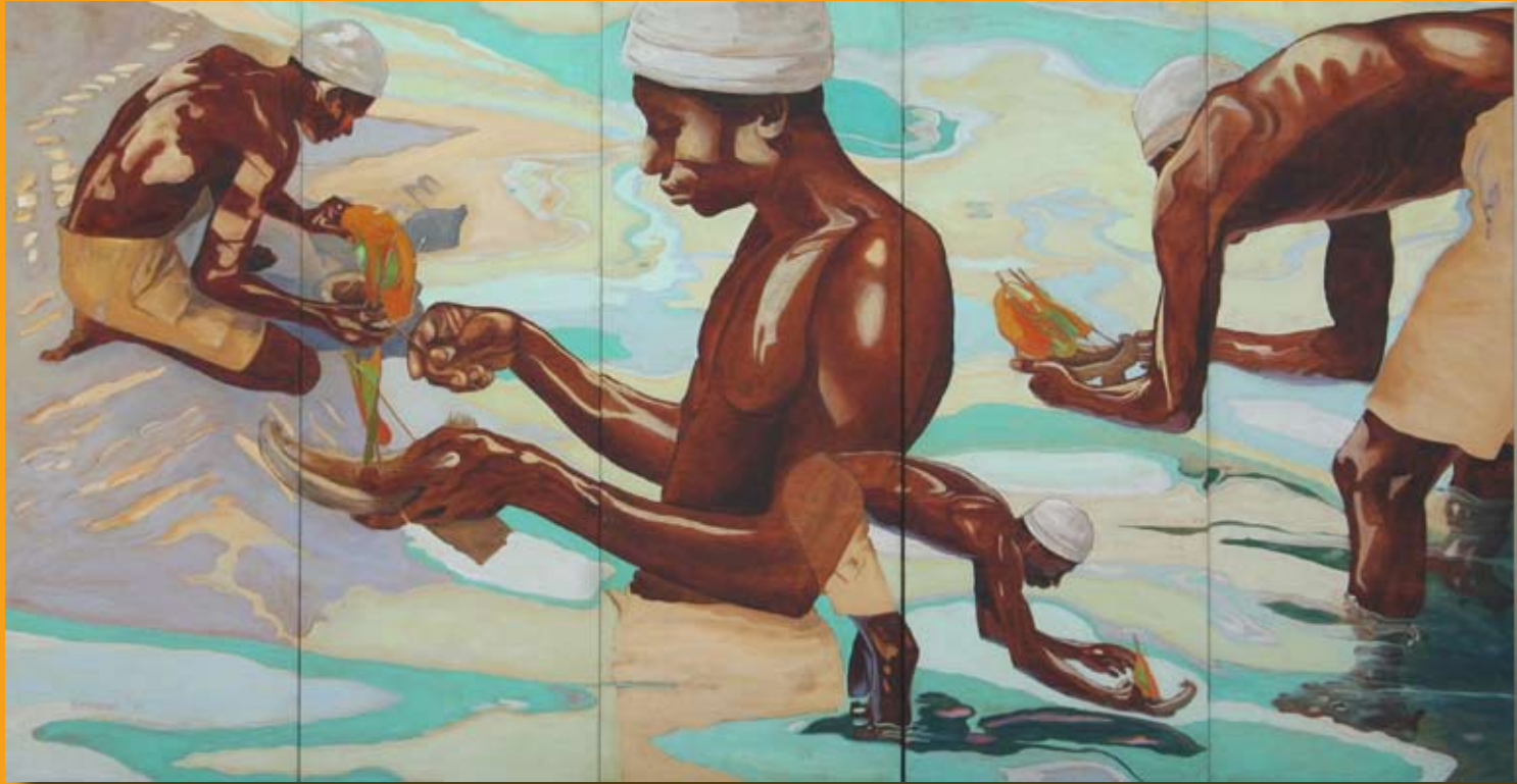
"Haitian & Coconut Boat"