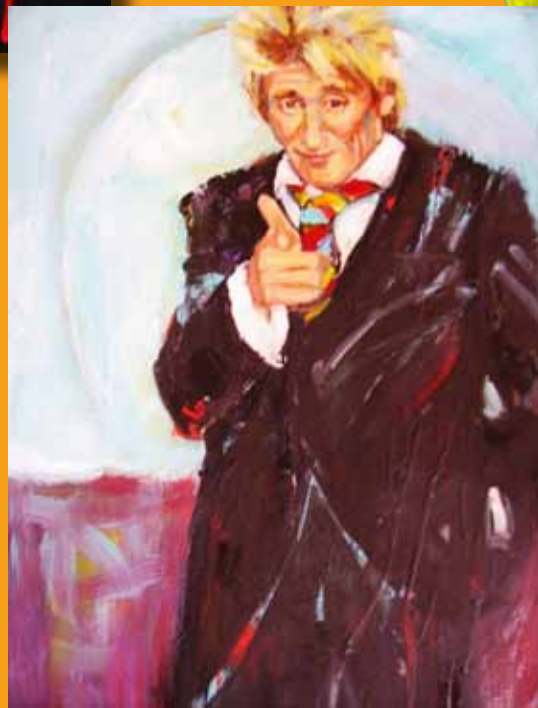
Andy Wahol, Rod Stewart and more...