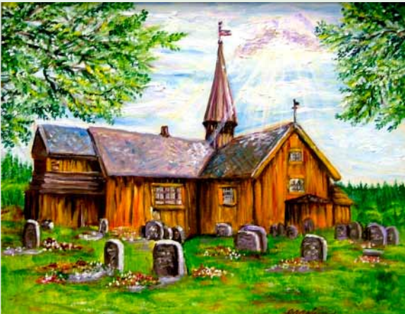
“Innset Kirke, Norway”