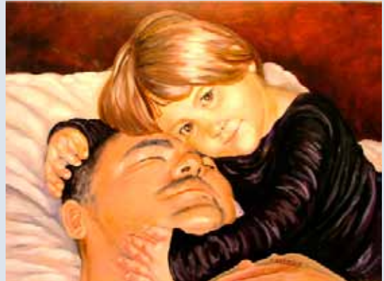
“With These Hands Love”