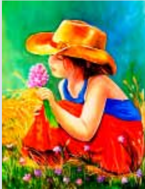
“With These Hands Wonder”

Portraits are a favorite of mine. The slightest crinkle in a nose or the twinkle in an eye can tell volumes about a person's personality. Faces are as varied as the flowers in springtime; as deep as the roots of a tree or the depths of an ocean. I hope viewers will experience awe and joy when they look at my paintings.